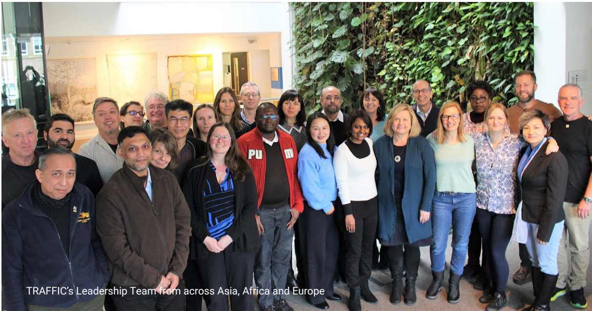
TRAFFIC's Leadership Team from across Asia, Africa and Europe