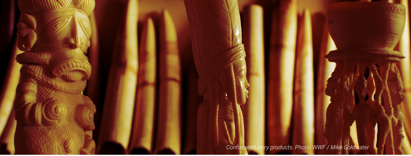
Confiscated ivory products.